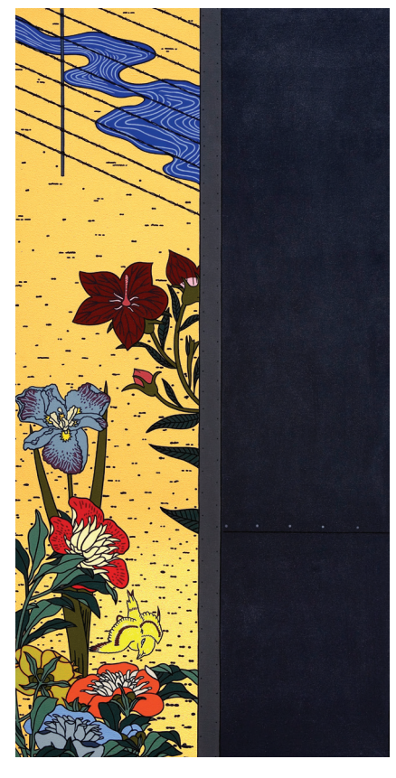
Roger Shimomura (United States, born 1939), Desert Garden #2 , 2007, acrylic on canvas, 72 x 36 in., courtesy of the artist