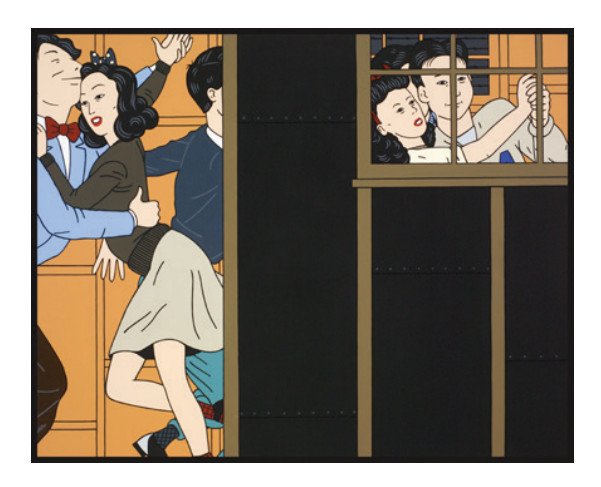
Roger Shimomura (United States, born 1939), Block Dance, 2007, acrylic on canvas, 36 x 45 in., courtesy of the artist