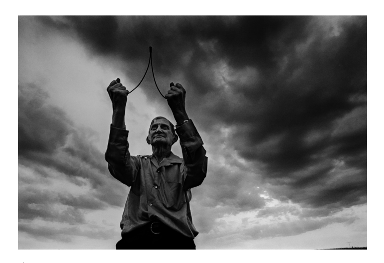
Jim Richardson (United States, born 1947), The Water Witcher, Kansas, 1975, pigment ink on fiber rag paper, 24 x 36 in. (image), courtesy of the artist