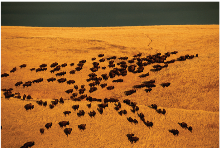
Jim Richardson (United States, born 1947), Bison at Sunset, South Dakota , 2003, pigment ink on fiber rag paper, 24 x 36 in. (image), courtesy of the artist