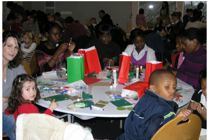
^ Holiday workshop participants