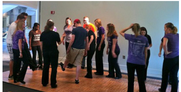
^ K-State Tap Dance Ensemble performance

View "Tree Of Life" and "Life Forms" and learn more about sculpting in wood. Create your own wooden sculptures (no carving involved). $5 per participant, $3 for members.